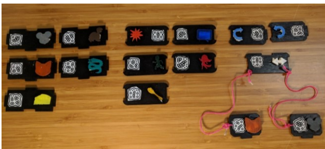
Figure 2. Blocks used in the initial StoryBlocks prototype include characters (mouse, turtle, cat, snake, cheese), actions (explode, talk, run, dance, eat), and control structures (repeat, branch).

StoryBlocks uses tangible blocks to represent programs. Because StoryBlocks may be used by blind learners, it was important that the tactile design of the blocks represent their function as clearly as possible. The initial set of blocks used in our prototype is shown in Figure 2.