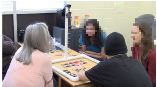
Figure 1. StoryBlocks is a tangible programming game in which users create audio stories by combining code blocks. Here a visually impaired high school student creates a story with assistance from teachers.

Varsha Koushik, Darren Guinness, and Shaun K. Kane. 2019. StoryBlocks: A Tangible Programming Game to Create Accessible Audio Stories. In 2019 CHI Conference on Human Factors in Computing Systems Proceedings (CHI 2019) , May 4–9, 2019, Glasgow, Scotland, UK. ACM, NY, USA. Paper492, 12 pages. https://doi.org/10.1145/3290605.3300722